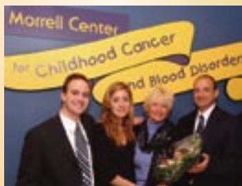
Albany Medical Center