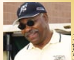
NFL Hall of Famer Bobby Mitchell