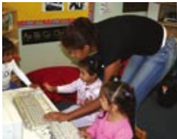
East Side House Settlement

The ESH is a community resource providing hope, help and results in the South Bronx. Stressing the importance of education, the ESH's focus is on critical developmental periods—early childhood and adolescence—and critical junctures at which people are determined to become economically independent. It supplements the public school system and places college within the reach of motivated students. The ESH also provides career readiness training to enable students to improve their economic status. For more information, visit www.eastsidehouse.org .